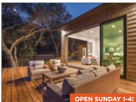
4351± Sq. Ft. | .60± Acre Lot | Offered at $3,495,000 | 115WildernessLane.com